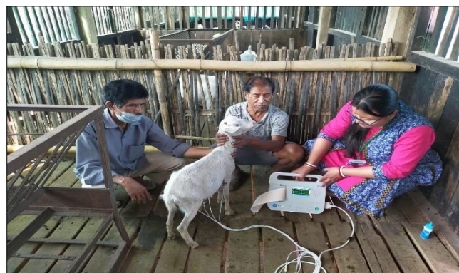
Fig 2: Performing an electrocardiogram (ECG) on goat at Goat Research Station, AAU, Byrnihat

None of the goat used in this study had any clinical signs of systemic diseases, respiratory, enteric, heart diseases and anemia etc. The standard bipolar limb leads (I, II, III) were recorded with the goats in a standing position, without sedation using alligator clip electrodes with a little cardiac gel applied just below the elbow and stifle joints of the forelimb and hind limb (Figure 1 & 2). ECG recordings were made during morning hour using 12-lead standard ECG recorder (Model-Cardiart GenX3, manufactured by BPL, India). The paper speed was set to 25 mm/s with the sensitivity of the machine was adjusted at 1 mv=10mm. Heart rate was calculated according to the R-R interval in lead-II. The amplitude and duration of P waves, QRS complexes and T waves were analysed in lead II. The duration of PR interval, ST interval and QT interval in lead II were recorded.