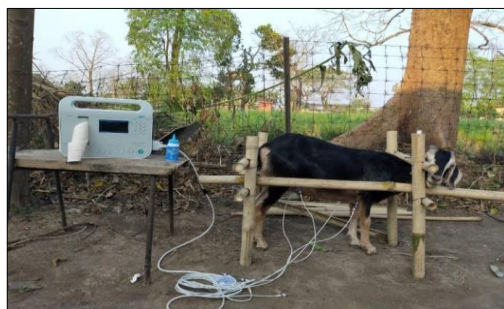
Fig 1: Performing an electrocardiogram (ECG) on goat at LRS, AAU, Mandira