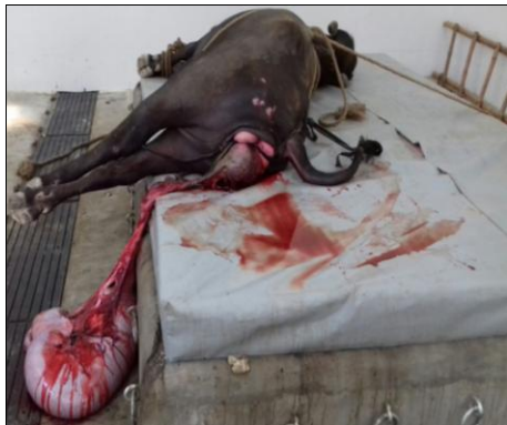
Fig 1: Prolapse of gravid genitalia in buffalo

The blood vessels were ligated, the gravid uterus was detached by using BP blade ligating the stumps and vaginal wall was sutured (Fig. 2 & 3) to avoid evisceration of abdominal contents through vulva. Both the ovaries were left intact. The urinary bladder was catheterized by using Foley's catheter no. 18 to prevent straining while micturition and modified Buhner's sutures were applied over the vulvar lips using infusion (drip) set tubing as suture material (Fig. 4). During the surgery, animal was administered with Inj. Normal saline 3 litres I.V., Inj. Metronidazole 2500 mg/500 ml I.V., Inj. Dexamethasone 40 mg I.V., Inj. Ceftriaxone 4 g I.V., Inj. Flunixin meglumine 1000 mg I.V., Inj. Tranexamic acid 2000 mg I.V. and Inj. Ascorbic Acid 7.5 g I.V. The animal was kept under observation and same treatment was continued for next 6 days. On seventh day, the Foley's catheter was removed and animal was discharged.