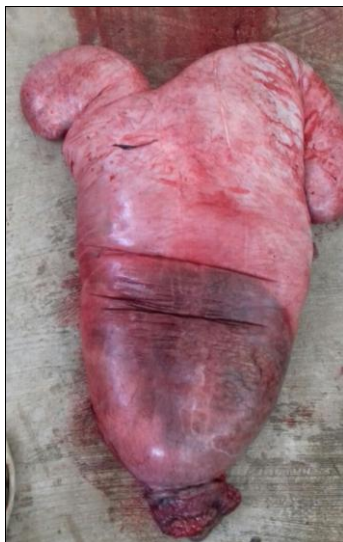
Fig 3: Surgical removal of gravid uterus