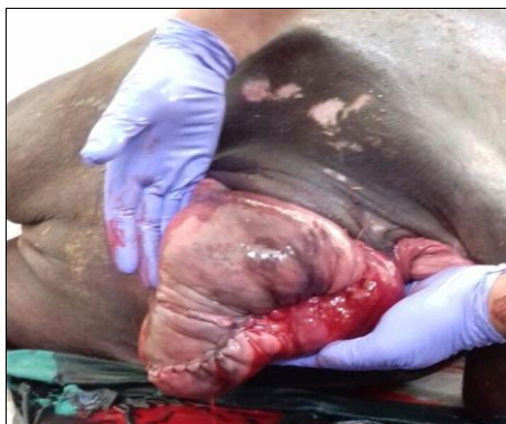
Fig 2: Suturing of vaginal wall